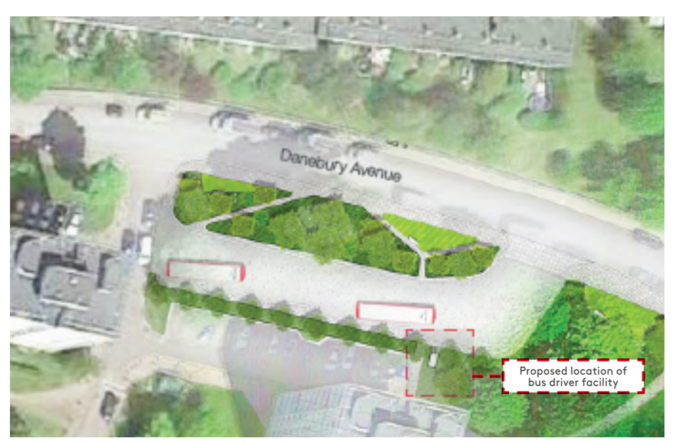
Artist's impression of new bus turnaround and driver facility

The existing eastbound bus stop, next to the junction of Danebury Avenue and Minstead Gardens, will be retained for the use of nearby residents.