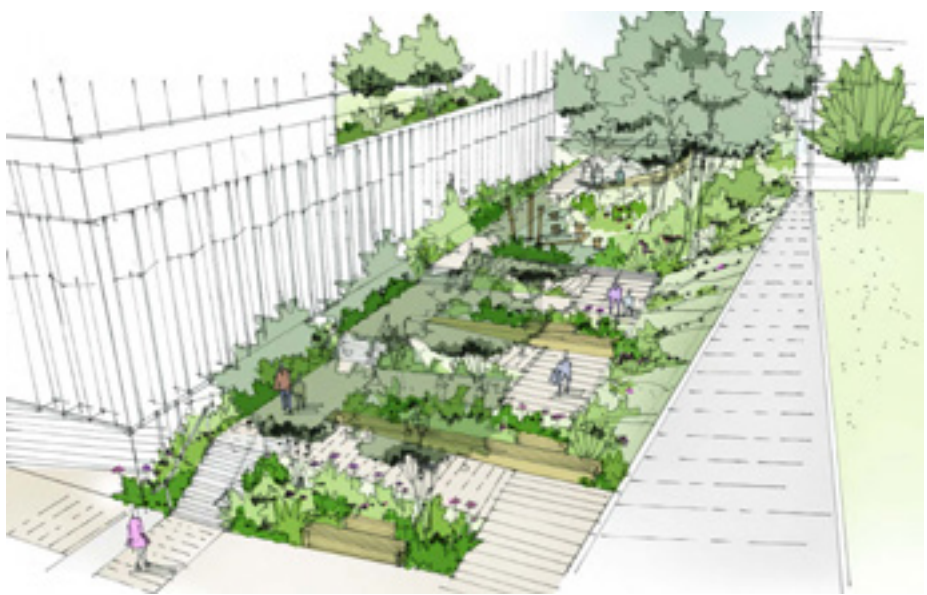
Artist's impression of the Hersham Close connection to the rear of Block A