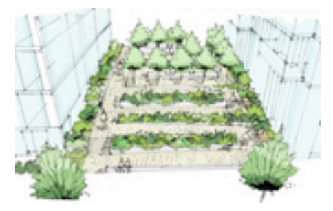
Linking Danebury and Harbridge Avenues