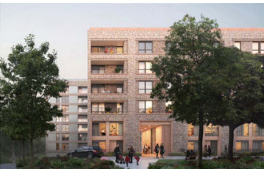
Artist's impression of Block Q