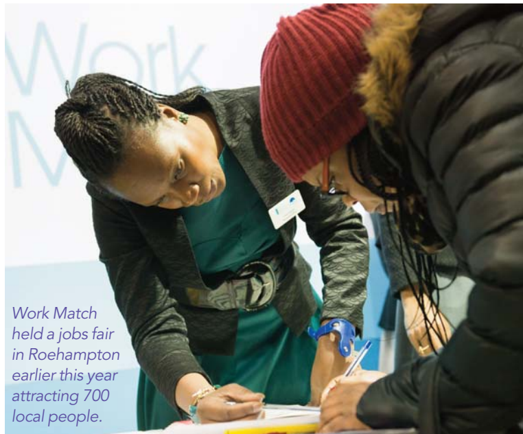
Work Match held a jobs fair in Roehampton earlier this year attracting 700 local people.

The council's Work Match service has helped dozens of local residents get back into work or training.