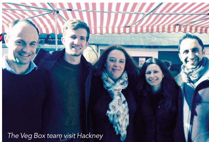
The Veg Box team visit Hackney

For more help visit www.stopsmokingwandsworth.co.uk