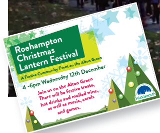
Last year's parade